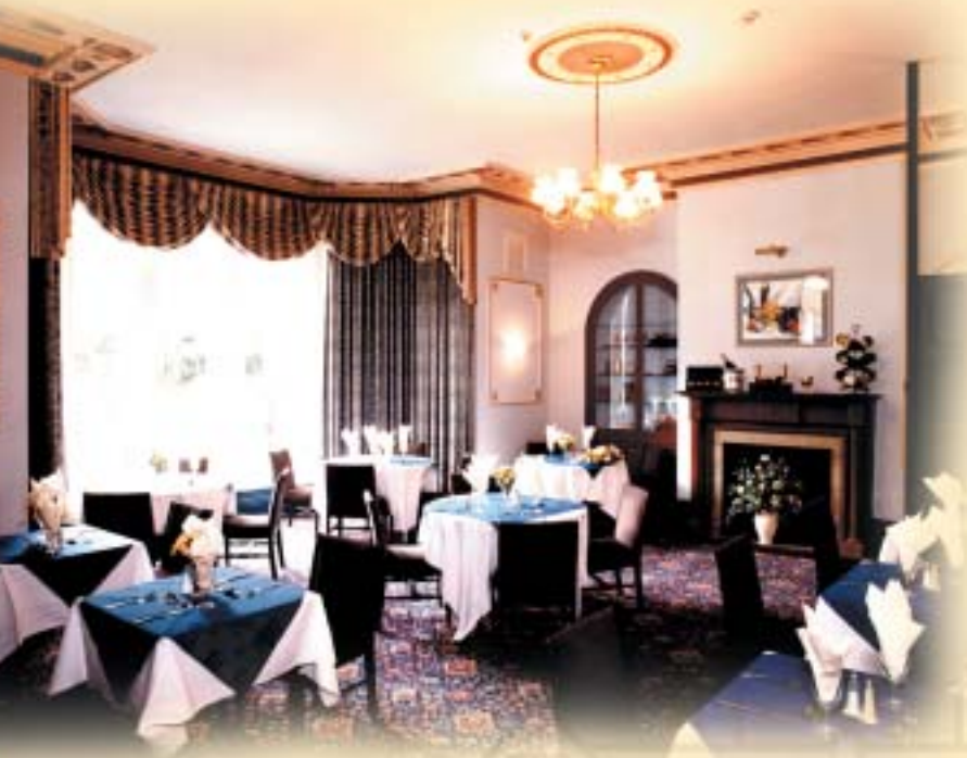
The Elegant Restaurant